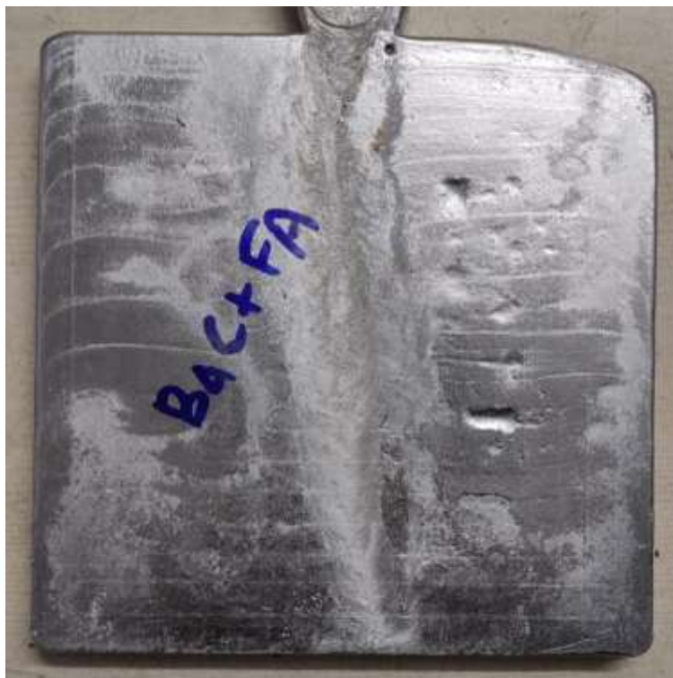
Fig. 2. Experimental Material Composite Material