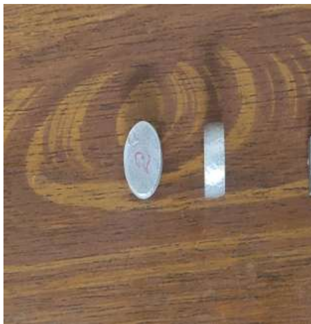
Fig. 5. Compressive Strength