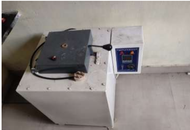
Fig. 3. Stir Casting Process