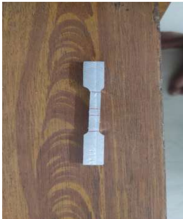
Fig. 4. Tensile Strength