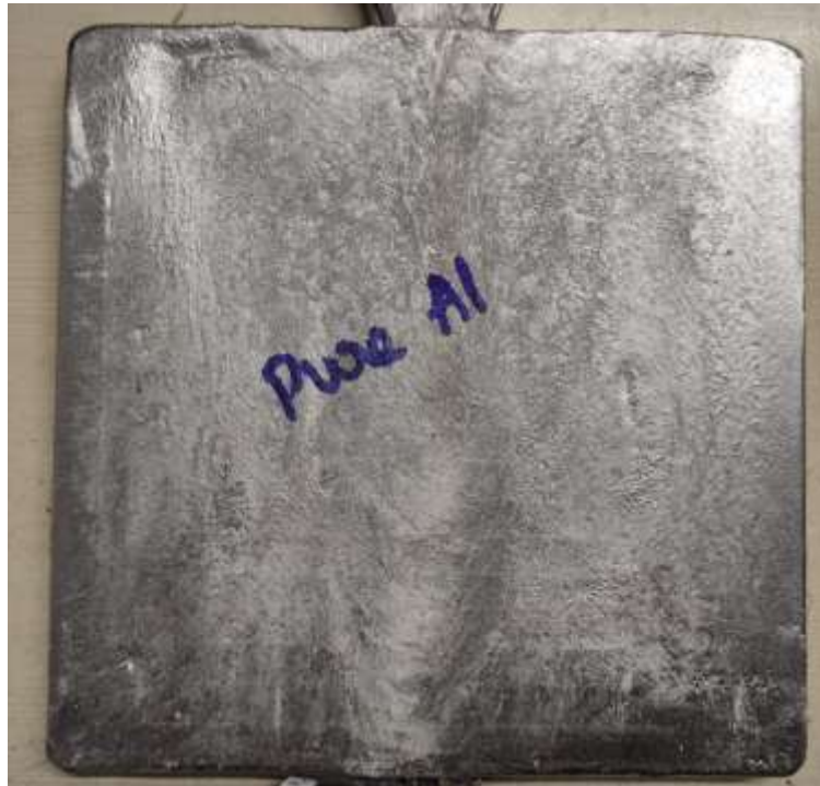
Fig. 1. Parent Material Pure Aluminum