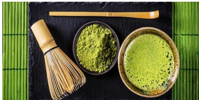
Fig. 1. Matcha Tea–A natural drink with antioxidant properties (Olivencia, J.M., Matcha Tea–A natural drink with antioxidant properties)