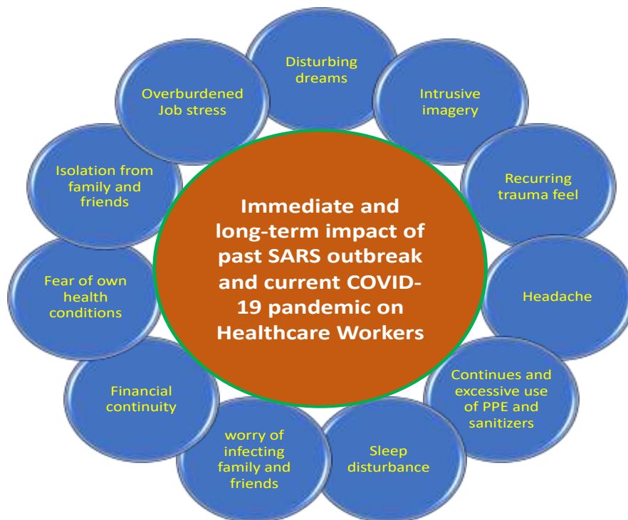
Figure 2: Immediate and long-term impact on HCW due to past SARS outbreak and current COVID-19 outbreak

The forefront HCWs were having moderate and severe anxiety and sleeping disorder in comparison to second-line HCWs (Lai et al, 2020). Furthermore, HCWs looking after the 906 COVID-19 patients from five hospitals in India and Singapore were correlated between their physical symptoms and psychologic symptoms (Chew et al, 2020). This evaluation used the depression anxiety stress scale (DASS-21), with subscales for anxiety, depression and stress. Nearly 11% were having the symptoms of depression, 16% were having the symptoms of anxiety, and 5% had stress. Of those, who reported anxiety, depression, and PTSD, more than 50% reported symptoms in moderate to extremely severe state. The physical symptoms reported by 66.7% acknowledged anxiety, lethargy, headache, and insomnia (Chew et al, 2020).