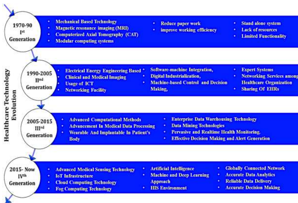
Figure 1: Evolution of healthcare generations

Year 2005 up to 2015 is said for Healthcare generation V.3.0, when there was improvement in computational methods and approaches. This included advancement in medical data processing software and hardware that provided effective medical diagnosis and treatment. Medical records were organized into electronic healthcare records (EHRs) which were stored, and processed in central computing system and further accessed quickly for analysis by healthcare provider. Medical devices became wearable and implantable in patient's body for pervasive and Realtime health monitoring. At the same time internet technology became more popular and easily accessible that provide countrywide sharing of EHRs and patient's physiological data to provide early and accurate diagnosis to the patients. This time EHRs from multiple hospitals were stored in huge volume in the form of bigdata with enterprise data warehousing technology. Further data mining technologies were advanced for extracting, analysing and interpretation of healthcare data. This included finding normal and abnormal patterns in EHRs, and decision making for detection and prevention of diseases etc. This time sensor-based technology including wireless sensor network and mobile adhoc network, 3-D printing and cyber physical spacing has been emerged and researched extensively in all most all application areas of world domain.