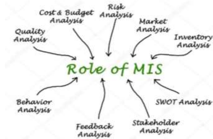
Figure 1.0: Role of MIS

The role of MIS not only advised decision-makers to make strategic decisions but also to provide several other analyses as shown in the diagram below. It is including to provide risk and market analysis, cost and budget analysis, feedback and others.