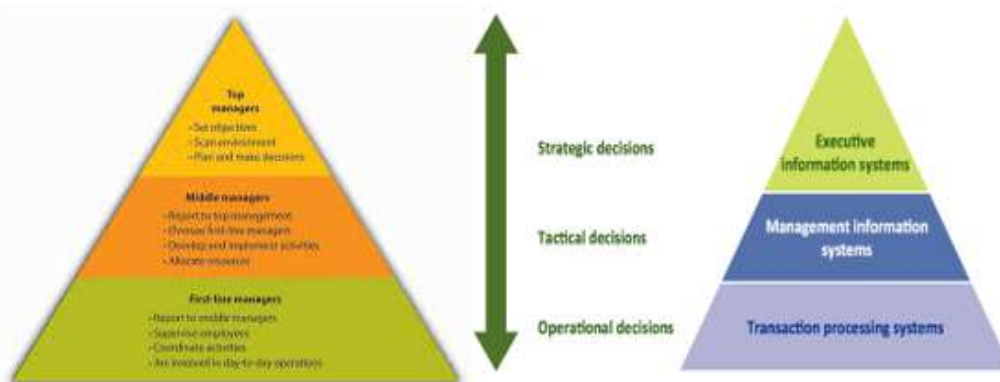
Figure 3.0: Management Level & MIS

Management Information System consists of several types namely