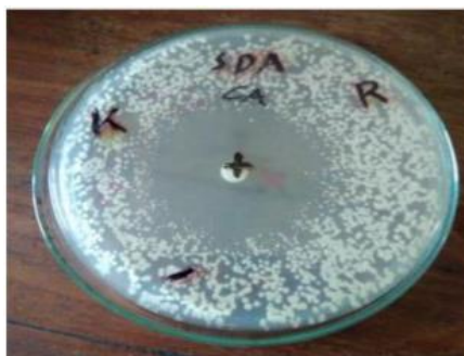
Figure 2. Results of basil leaf extract (K) and ruku ruku leaf (R), positive control (+), negative control (-) antifungal activity test. 12

Antifungal Activity Test of Basil Leaf Extract and Ruku Ruku Leaf - Antifungal test was carried out using C. albicans as the test fungus and using fluconazole as well. The antifungal activity of the sample and fluconazole was shown by forming a clear zone around the paper disc. The antifungal test results of basil and ruku leaf extracts can be seen in Fig. 2.