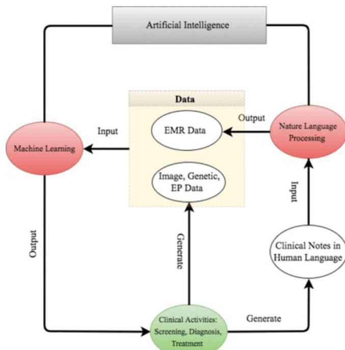
Figure 2: The path from medical information creation through data augmentation via natural language processing, ML data analysis, and clinical decision-making. EMR stands for electronic medical record, while EP stands for electrophysiological.

The flow chart in figure 2 depicts the path from medical information production to medical decision making, including Natural language processing data enhancement and machine learning data processing [7]. The route plan, we see, begins and finishes with clinical actions. As strong as they are, Artificial Intelligence approaches must be driven by clinical concerns and used to aid clinical practice in the end.