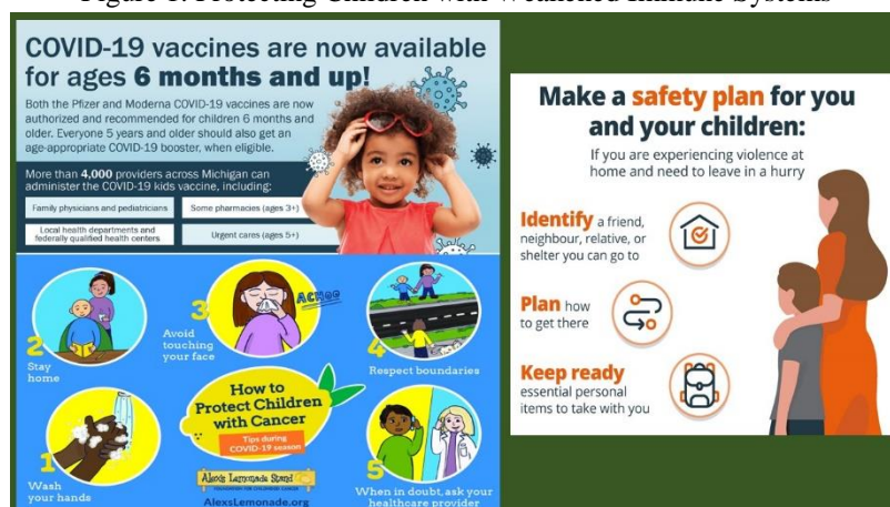
Figure 1. Protecting Children with Weakened Immune Systems

The corona vaccine does not provide complete immunity and the recovery period is relatively long, and the person is quarantined and away from his family during the illness, and most importantly, this disease has caused the death of many people since its appearance [26]. The combination of these factors will lead to severe stress and anxiety,