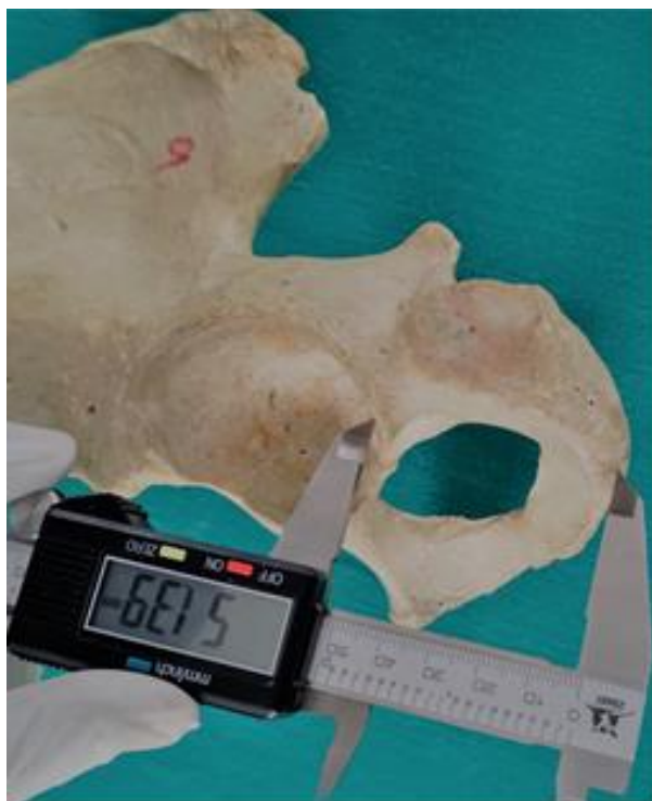
Figure.No.4 Measuring the length of ischium