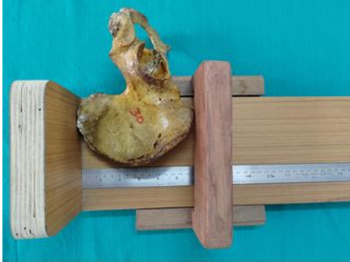
Figure.No.2 – Measuring the width of the Hip bone