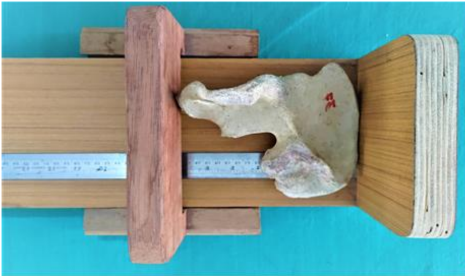
Figure.No.1 – Measuring the length of the hip bone

the pyriformis tubercle is located at the posterior border of greater sciatic notch by joining the pyriformis tubercle and tip of ischial spine the width of greater sciatic notch can be obtained.