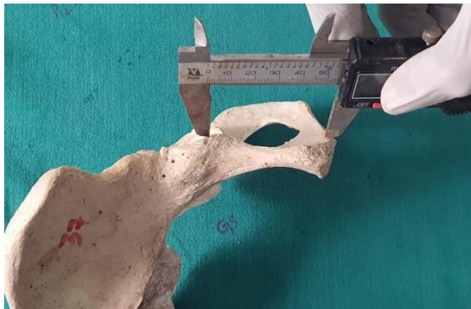
Figure.No.3 Measuring the length of Pubis