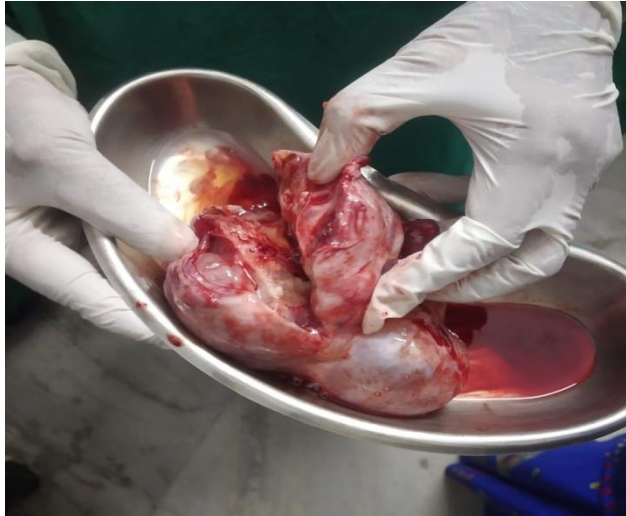
Fig A) COMPLEX OVARIAN CYSTIC TUMOUR