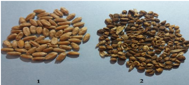
"Picture 2.1: healthy grains of wheat; 2 - mature galls with more dark color (original)"

Wheat nematode galls are essentially wheat grains filled with larvae. They ripen at the same time as healthy grains. Mature galls are very different from healthy wheat grains in their darker color. They can be mistaken for weed seeds (Fig. 2).