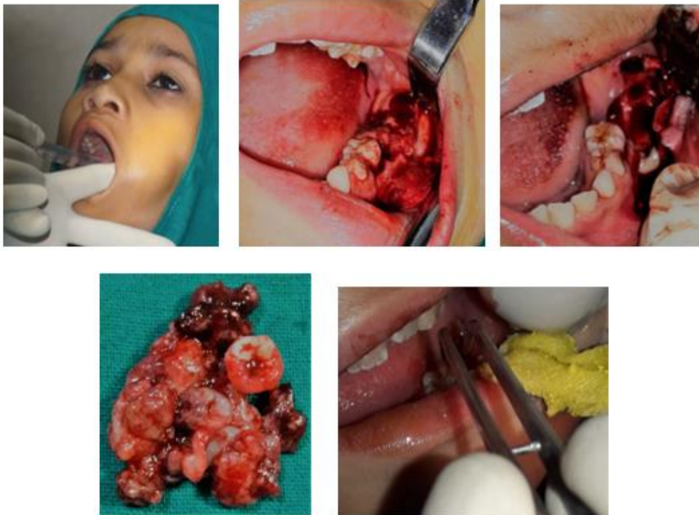
Figure5: Inter-operative photographs

Treatment planning was done, and patient was subjected for surgery under LA. During the procedure thinning of buccal plate was observed, carefully marsupialization was done with preservation of Inferior alveolar nerve and cortical plates (as it helps in healing and remodelling). During marsupialization bud of 37 was removed with the pathological mass as it was involved with the cystic lining. The sutures were given and IODOFORM gauge was packed inside the cystic cavity. Patient was recalled weekly for iodoform gauge dressing and follow ups.