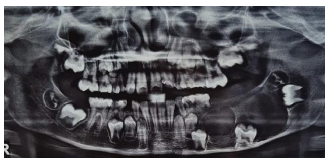
Figure3: OPG reveals provisional diagnosis of Dentigerous cyst

The OPG revealed large multilocular radiolucency on left side of mandible. The cystic lesion was noticed from distal surface of 74 extending up to anterior border of ramus. The cavity walls margins were well defined, multilocular, which suggests provisional diagnosis as Dentigerous cyst.