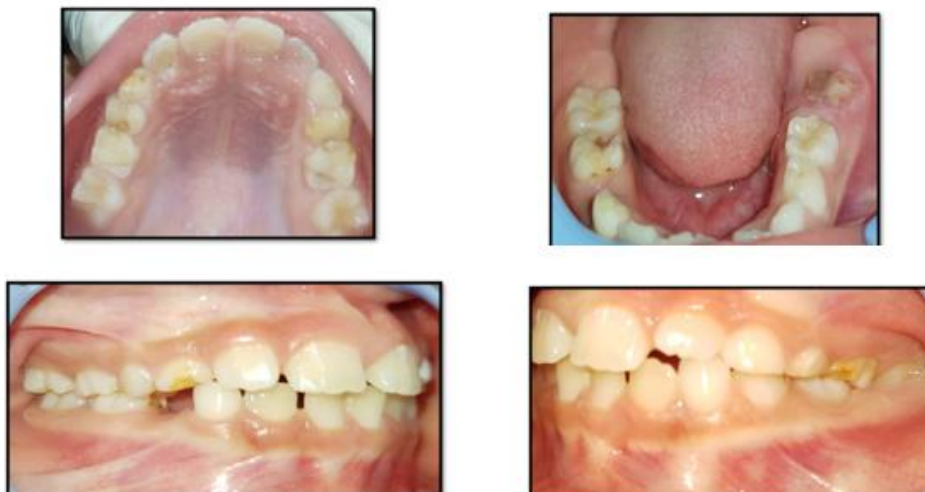
Figure2: Intra-oral images