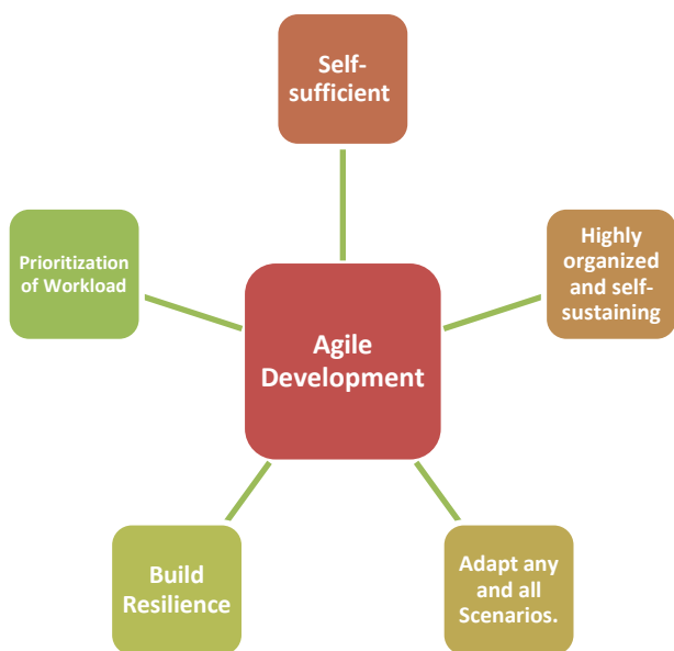
Figure No.1 Features of Agile Framework

Agile Framework follows comprise requirements discovery and solutions enhancement through the joint effort of self-organizing and cross-functional teams with their customer(s)/end user(s), adaptive planning, evolutionary development, early delivery, continual improvement, and flexible responses to changes in requirements, capacity, and understanding of the problems to be solved as shown in figure no.1. Basically, agile software is working software which adopts changes of respondents and works very close in real time environment and customers. Due to these best qualities changes, customer requirements (needs) are easily identified, reframed, redesigned and implemented.