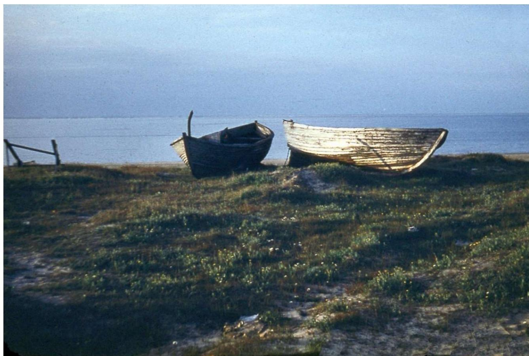
Figure 3. Pechora Bay

of the territory. The zone of actual damage was, according to different estimated 67-79 ha - Figure 3 and 4. As a result, the state of 1999 from oil pollution 400 hectares had to be cleared.