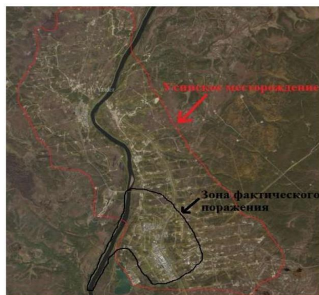
Figure 2. The actual zone of destruction of the OS during the accident at the Usinsk field in 1994 year

All were stopped oil fields that pumped oil through an emergency pipe. "Spilled oil covered an area of 79 hectares with a layer from several centimeters to one meter. This territory became unsuitable for the growth of all plant species and the life of most species animals".