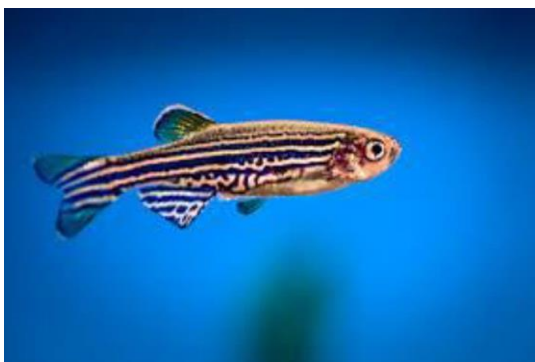
Fig. 1: Zebra fish 1