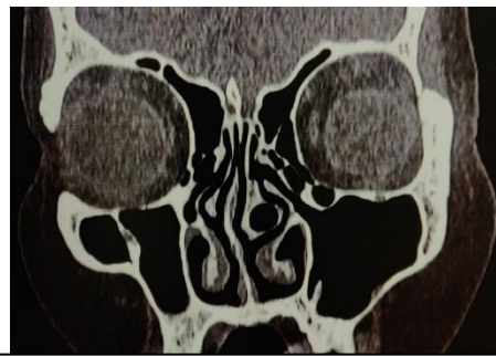
CT PNS SHOWING LEFT SIDE DNS WITH CONCHA BULLOSA