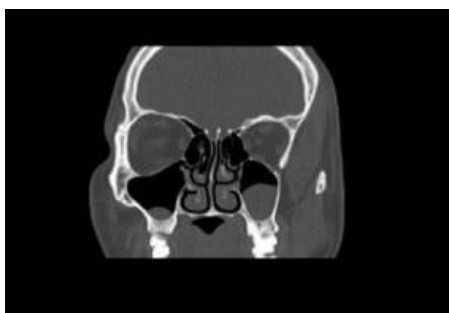
CT PNS SHOWING BILATERAL ETHMOIDAL BULLA