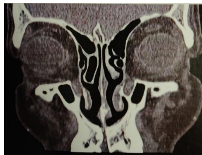
CT PNS SHOWING RIGHT SIDE CONCHA BULLOSA