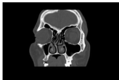
CT PNS SHOWING RIGHT PNEUMATISED UNCINAT PROCESS