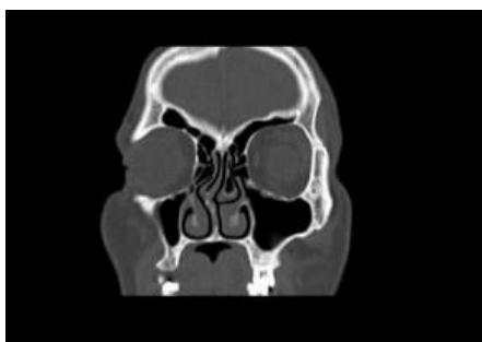
CT PNS SHOWING SEPTAL SPUR TO RIGHT SIDE

Zinreich et al.,[40] and Kennedy et al., [41] described Haller's cells as ethmoid air cells found inferior to the ethmoid bulla adhering to the roof of the maxillary sinus, in continuity with the proximal infundibulum, which formed part of the lateral wall of the infundibulum. They are considered as ethmoid cells that grow into the floor of orbit and may narrow the adjacent ostium of the maxillary sinus especially if they become infected [42]. Davis et al., [43] noted the haller cell is thought to cause chronic sinusitis cases by impinging on the ostium of the maxillary sinus and infundibulum by inhibiting the ciliary function, leading to obstruction of the ostium. In our study prevalence was found to be 13% which is similar to 16%, Llyod et al., [36] 15%, Perez-Pinas et al., [24] 20%, Tonai and Baba [39] 36%, Bolger et al., [33] 45.9%, Maru et al., [26] 36%, Alkire BC et al., [27] 39.9% and Asruddin et al., [31] 28% respectively.