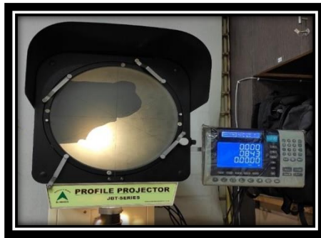
Fig 11 : Measurement of horizontal separation