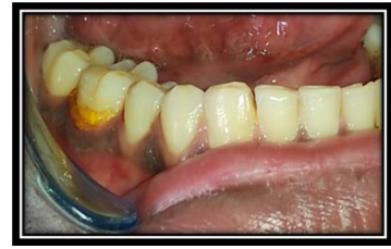
Fig 3 : Gingival retraction done with racegel