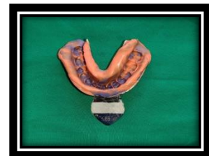
Fig 6 : Impression made after retraction