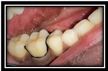
Fig 1 : Gingival retraction done with retraction

Baseline impressions were made for the control group in which no gingival displacement was done. 15 Impressions were made with addition silicone and removed from patient's mouth after the material was set and it was rinsed under running water. Then the impressions were poured with type IV gypsum product - Die Stone (Kalrock, Kalabhai Dental Products, India).