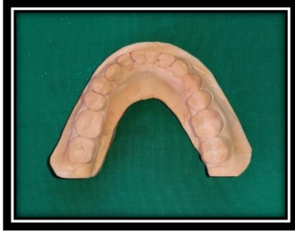
Fig 7 : Cast obtained from the impression.