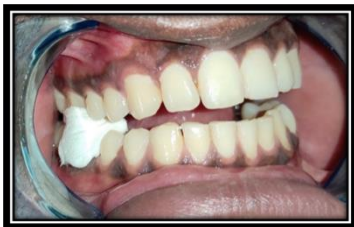
Fig 4 : Gingival retraction done with comprecap.