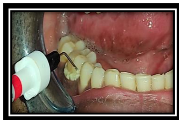
Fig 5 : Gingival retraction done with traxodent.