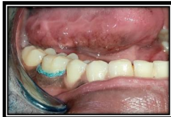
Fig 2 : Gingival retraction done with capsule.