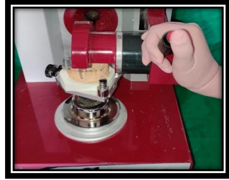
Fig 8 : Sectioning the mandibular right molar from the mid buccal groove.