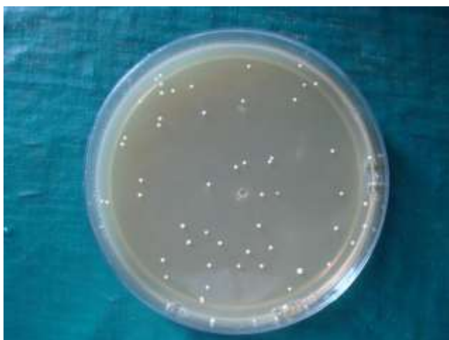
Figure 1 - Figure showing candidal colonies formed on Sabouraud's Dextrose medium and incubated at 37°C for 48-72 h.